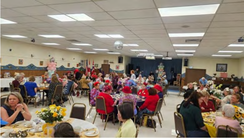
Our lodge full of "Tea Party" diners