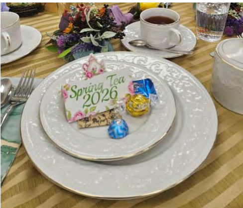
A thoughtful place setting with precise detail

Our Spring Tea was a lovely event with live music! Special thanks to all the hostesses, food preparers, and setup/cleanup crews. A job well done and appreciated by all.