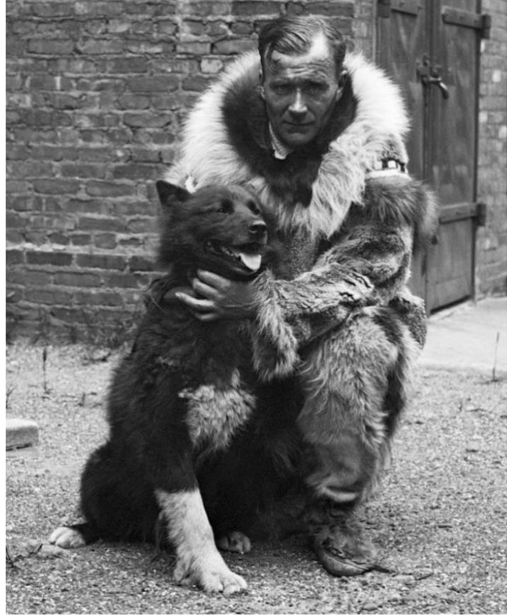
Gunnar Kaasen with Balto

How Togo prevented an epidemic in Alaska | A Remarkable True Story