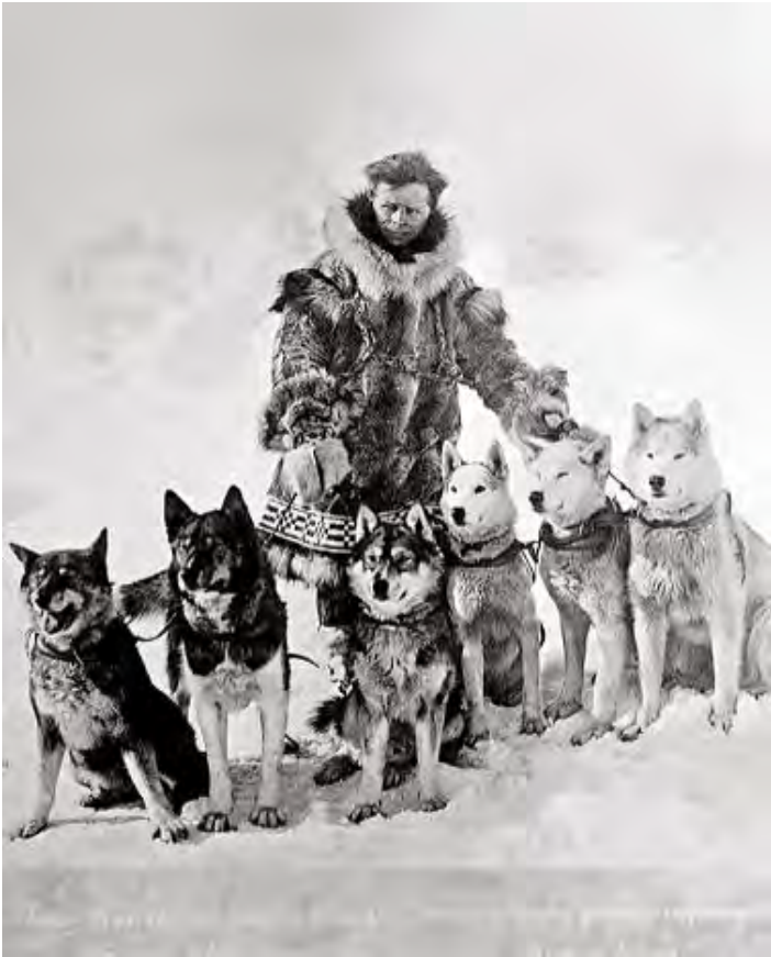
Leonhard Seppala with his sled dogs: Togo is at the far left with his other dogs from left to right, Karinsky, Jafet, Pete, Zeus and Fritz

How Togo prevented an epidemic in Alaska | A Remarkable True Story