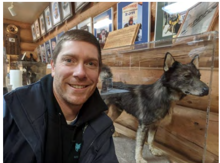
Balto, weighing 45 pounds, (left) and Togo, weighing 48 pounds, are currently on display in their taxidermy forms at the Cleveland Museum of Natural History, Ohio, and at the Iditarod Headquarters, Wasilla, Alaska, respectively. These dogs display the Norwegian-born Seppala's breeding and training expertise.