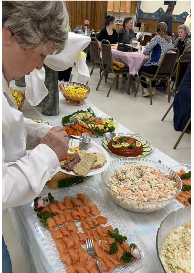
Above and to the right: Buffet Line, Below: Just some of the Kitchen Crew