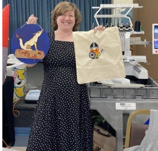
Left: A happy shopper with her finds